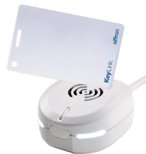
Employee taps RFID Key Card across the Puck.