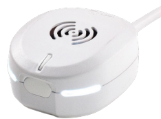
KeyLink Puck, located up to 75' away, beeps alerting employee.