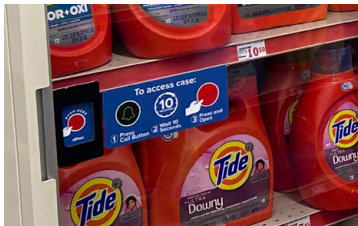
Customer presses button to notify staff of desired case access.