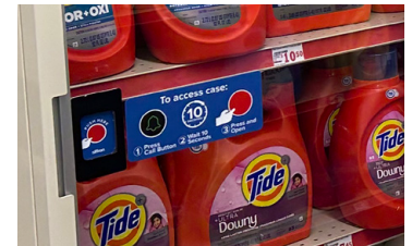
Case unlocks with audible beep notification. Customer retrieves product and doors auto-close.

For more information, call: 800-411-4090 email: LossPrevention@siffron.com