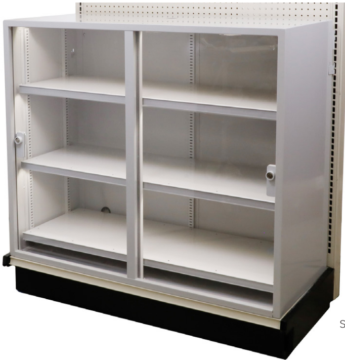
Secure Case™ 40" H