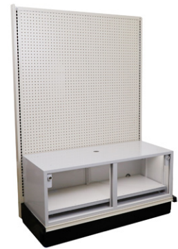
Secure Case™ 17" H