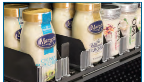
Add to fresh areas

Individual components can be selected to configure nearly any product style, size, and shape. To simplify ordering and installation, the most popular sizes and colors are available in convenient kits. Kits include Kwik-Connect™ front rail, left end divider, center push dividers, center pusher tracks, and center push right divider. They come fully assembled for quick and convenient box-to-shelf installation.